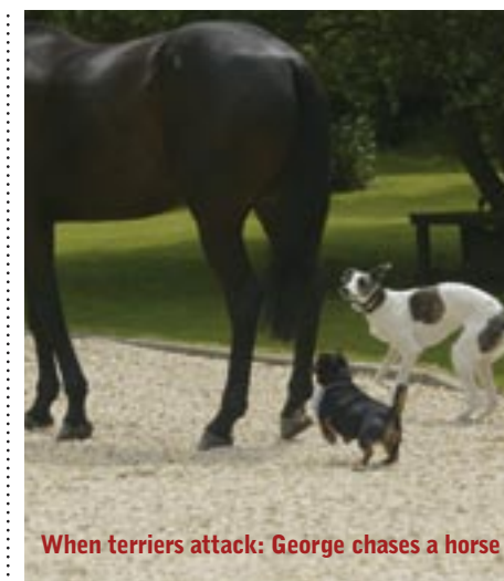
When terriers attack: George chases a horse

◀ Guilty until proven innocent: the top dog waits to be taken down a peg by Doglistener